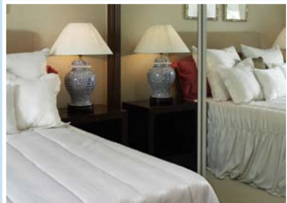
Mirrored doors on the wall or dressing table can cause confusion in a bedroom. A mirror at the end of a bed can have the same effect.

Try to give an element of independence to allow control over activities and actions for as long as possible.